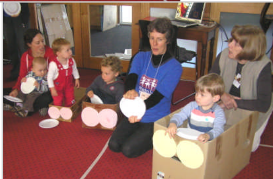
ABOVE & RIGHT: mainly music Box Day